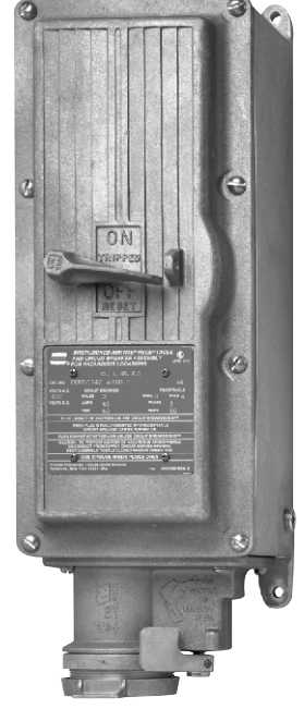
CAUTION: To reduce the risk of ignition of hazardous atmospheres, do not use plugs or receptacles in Class II, Group F locations that contain electrically conductive dusts.

Dim. "b" and "bb" are exposed portion of plug when engaged with receptacle.